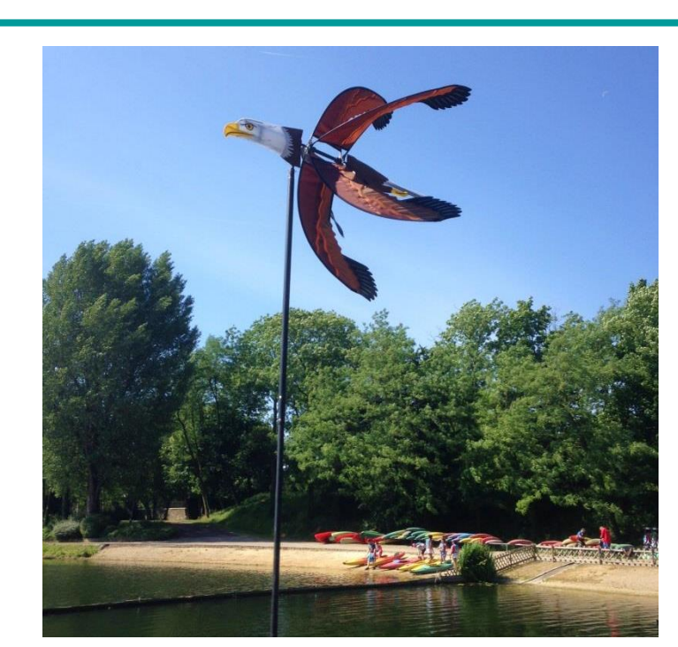
Figure 1: Scarecrow (Eagle) to scare off birds.

A part of this project was to test the hypothesis of bacteriological contamination by aquatic birds massively occupying the leisure center (fig.1) using a microbial source tracking technique. This approach relies on the quantification by real-time PCR (qPCR) in water, sand, and sediment of bacterial specific markers of the digestive tract of different animal species (geese, seagulls, dogs) and humans.